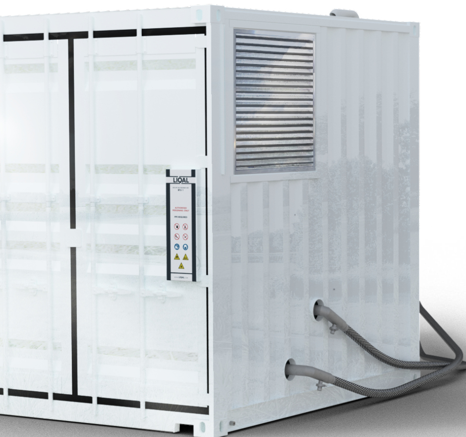
LIQAL Boil-off Gas Treatment Unit (BTU)

We made sure the BTU system was designed to deliver extreme reliability over its long lifetime. Its internal components have been built to last, are field-proven and require fewer maintenance interventions in demanding use and high-throughput applications compared with other liquefaction systems on the market, resulting in a low TCO. Simply put, our BTU system is worth the investment.