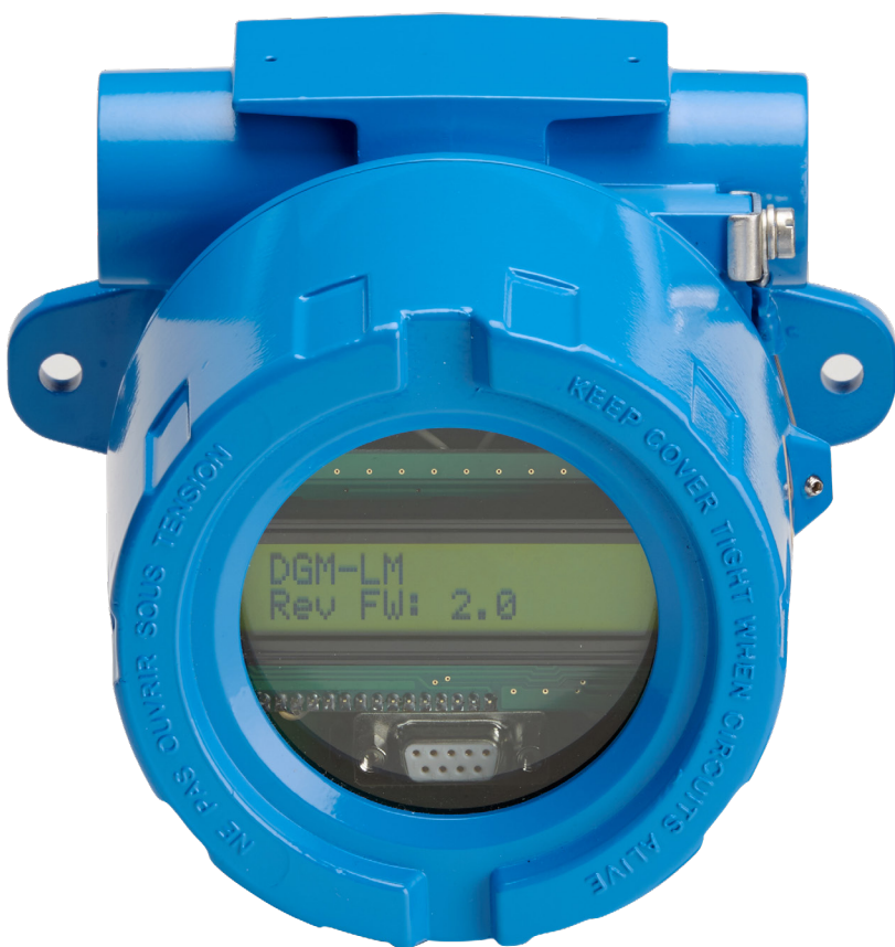
Digimon LCD Atex