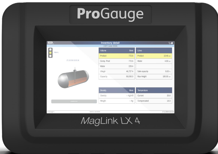
ProGauge MagLink LX 4