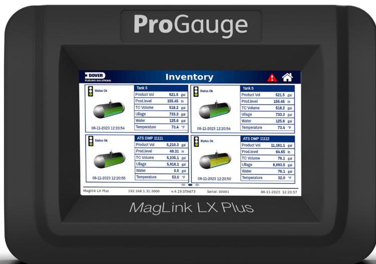
ProGauge MagLink LX Plus