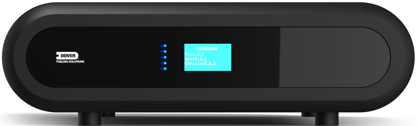
DFS Fusion ® automation server version 3